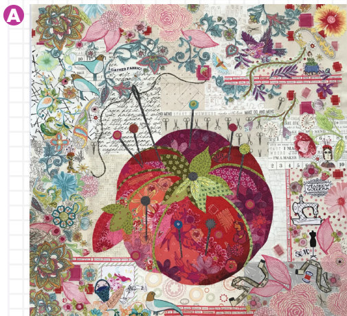
7 DESIGNS TO CHOOSE FROM!